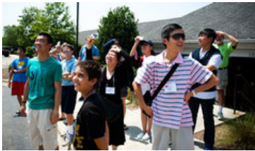
Hopewell Academy summer camp students gather to watch a science experiment.